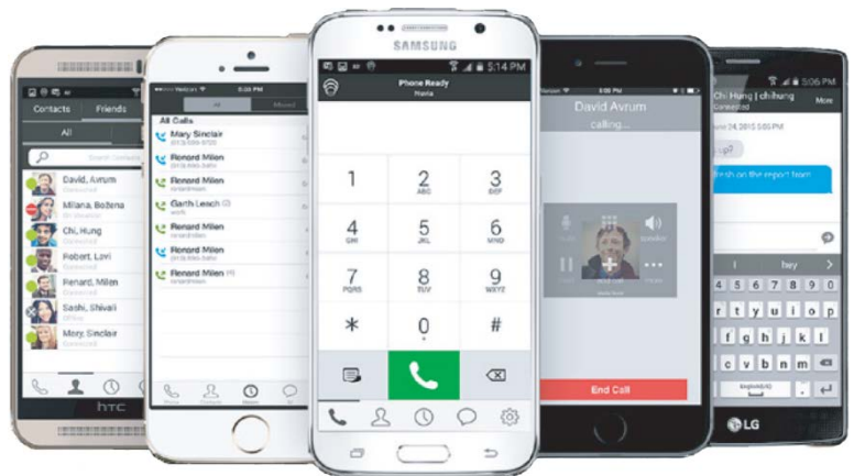
Smart Office for Mobile

For more information contact us through our website at temovi.cloud